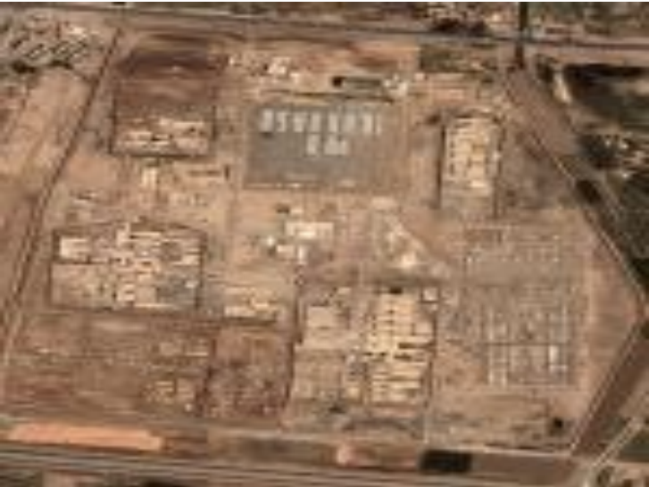
Satelitte Photograph of Abu Ghraib 14