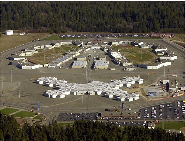
Birds eye view of Abu Ghraib 12