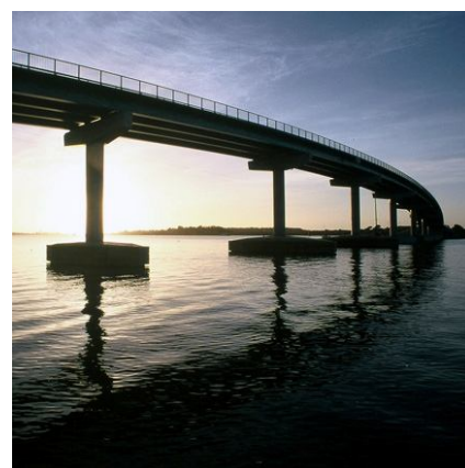
Hindmarsh Island bridge