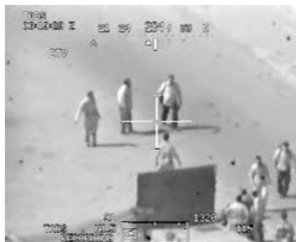
Still from Collateral Murder

It’s worth recalling the first Wikileaks project to garner major international attention: a video, shot from an Apache helicopter in 2007, in Iraq, that documented American soldiers killing up to 18 people. For years, Reuters sought to obtain that video through FOIA [Freedom of Information Act] because two of its staff members were among the victims. Had the military released this footage to the wire service, and made whatever minor redactions were necessary to protect its operations, there would never have been a film titled Collateral Murder — the name of Wikileaks’s package for the video — because there would have been nothing to leak. Even after Assange had published the footage, and even though the events documented in it had been previously revealed in detail by a Washington Post reporter, the military (at least, as of July) has still not officially released it.