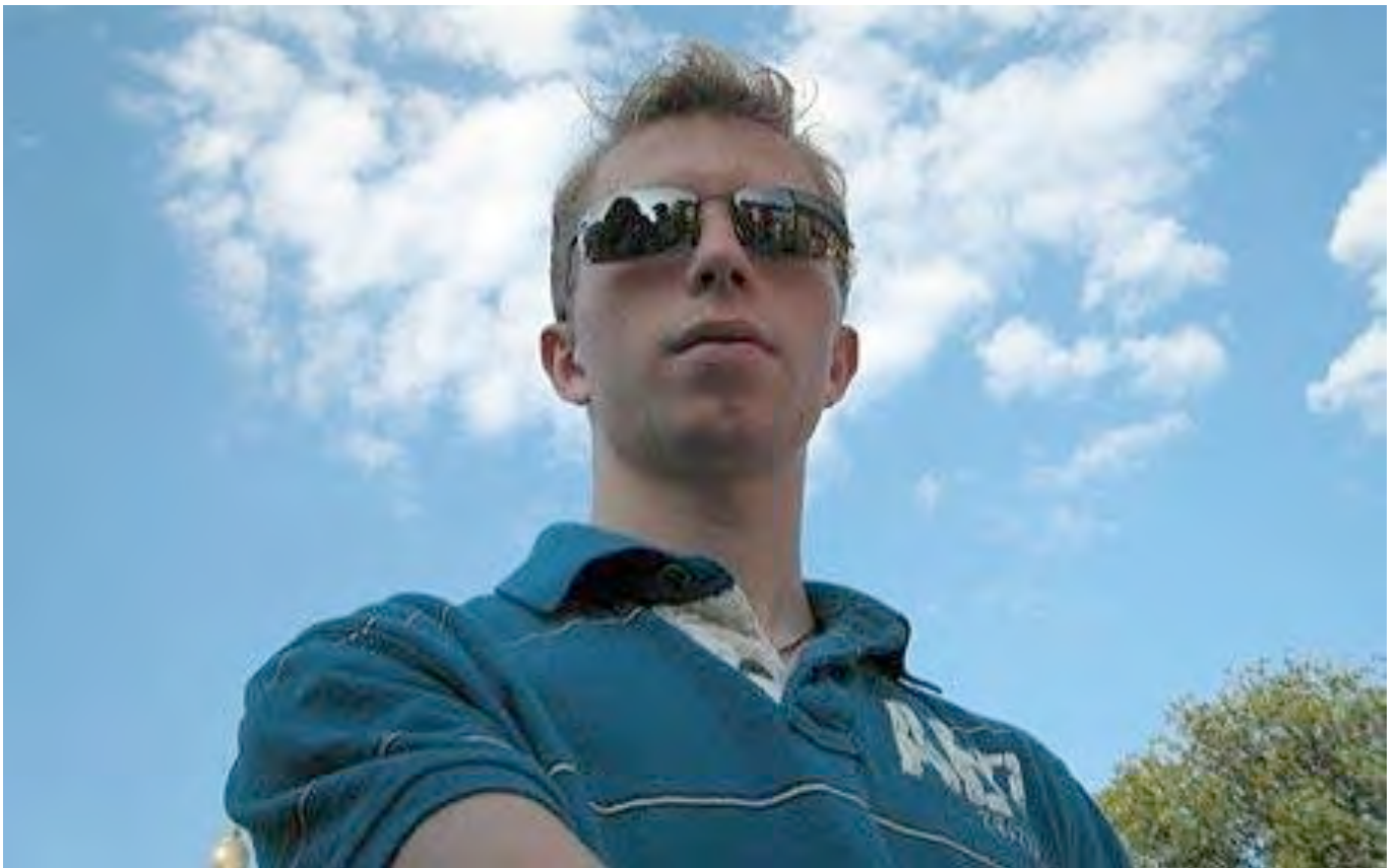
Bradley Manning, US military whistleblower — see pages 3–5