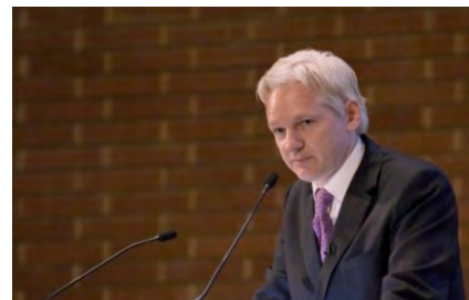
Julian Assange at the debate

Yesterday’s New Statesman /Frontline debate offered 900 people — including droves of photographers and camera crews — the chance to hear Julian Assange and others debate the motion: “This house believes that whistleblowers make the world a safer place.”