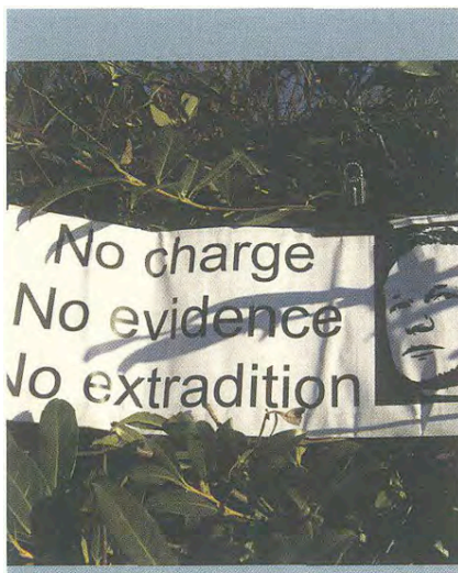
Appeal to reason: support for the WikiLeaks founder

Seen within this historical perspective, the New York Times ’s performance in the run-up to the US-led invasion of Iraq, and its hostile attitude to WikiLeaks today, are not surprising.