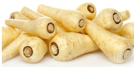
Don't use these in a carrot cake

This case also illustrates the difficulties caused by the transfer system. A principal may be capable of making a really good carrot cake but the department sends him parsnips. The parsnips may be perfectly good parsnips but they don't work well in a carrot cake. So the only way for the principal to deal with the situation is to attack the parsnips, smash them to smithereens, and then hope that the department will replace the smashed parsnips with carrots.