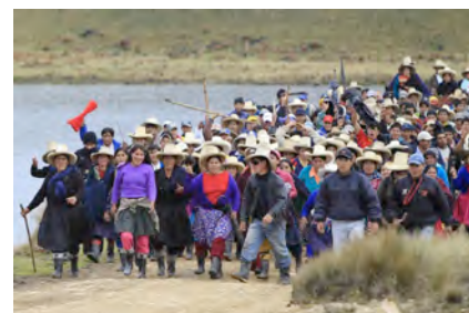
Protesters in Peru, 2011

The most effective challenges to such governments involve a wide range of non-standard methods of action, such as rallies, strikes, boycotts and occupations. Campaigns relying on such methods are more effective than armed struggle. 7 There are several features of such campaigns worth noting.