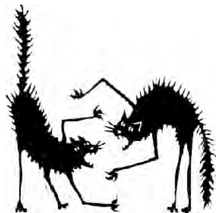
Whistleblowers can have conflicts too.