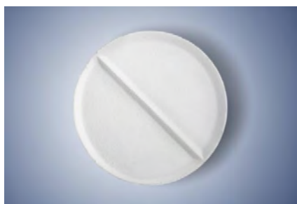
Buy a cheap tablet.

Suppose the investigator goes into your computer and checks all your files and goes into your email account and checks all your messages. That means you shouldn't leave any trace of your activity on your computer or email. So pay cash to buy a cheap computer, for example a tablet or netbook. Make sure it is not connected to the web, disable GPS and do all your writing on it.