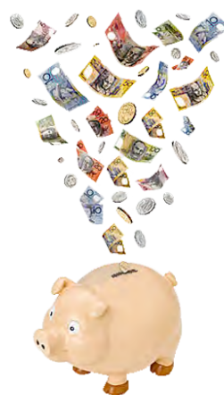
Cash escaping from WBA's bank account

deposit earnings were also down from $1,199 to $794.