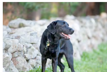
Very few police dogs are trained to detect USB drives.

Usually you will not have to deal with sophisticated defences against leaking. At some national security offices, security is so lax that it's possible to obtain paper or digital files with ease. 13