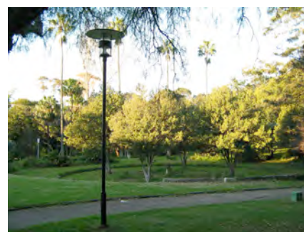
Callan Park garden