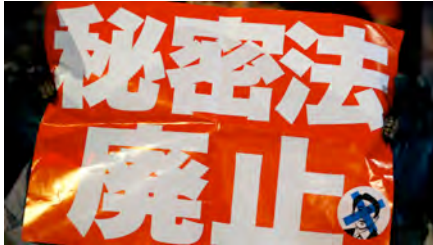
Placard with an image of Japan's Prime Minister Shinzo Abe at the rally against the state-secrets law, Tokyo, 9 December 2014

DEMONSTRATORS flooded Tokyo's streets over a just-activated secrecy law set to threaten the disclosure of government wrongdoings, as well as limit press freedom. The government hopes the added safeguards will lead to intelligence-sharing with the US.