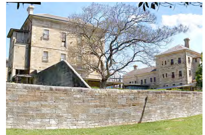
Callan Park Hospital