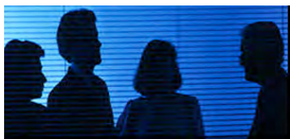
Meeting of anonymous whistleblowers