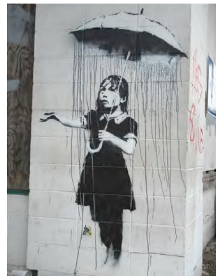
An illusion of protection

Legal protection is not a guarantee against reprisals. Furthermore, employers are almost never held to account for taking reprisals against whistleblowers, even when they are supposed to be protected legally. The lesson here is not to rely on whistleblower laws: they may give only an illusion of protection. 4 This is why remaining anonymous is often a better option.