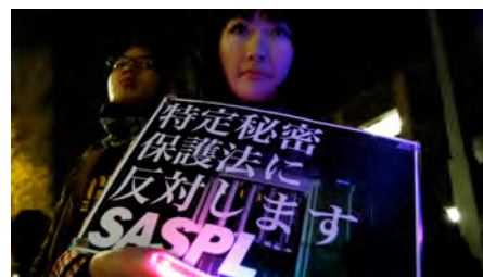
Placard at the 9 December rally

“It cannot be said that all our concerns have been alleviated,” it read.