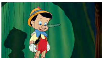
Pinocchio hides his revealing nose

After you have leaked, you need to pretend that you are not the leaker. You need to behave just as you would if you hadn't been the leaker. This is a form of acting. Contrary to popular opinion, research shows that most people can lie convincingly and that few people can detect lies, so you can probably do it well, especially if you believe in what you are doing. 14 It is legitimate to lie in a good cause, for example in occupied Europe during World War II when Nazis came to people's houses asking whether there were any Jews inside.