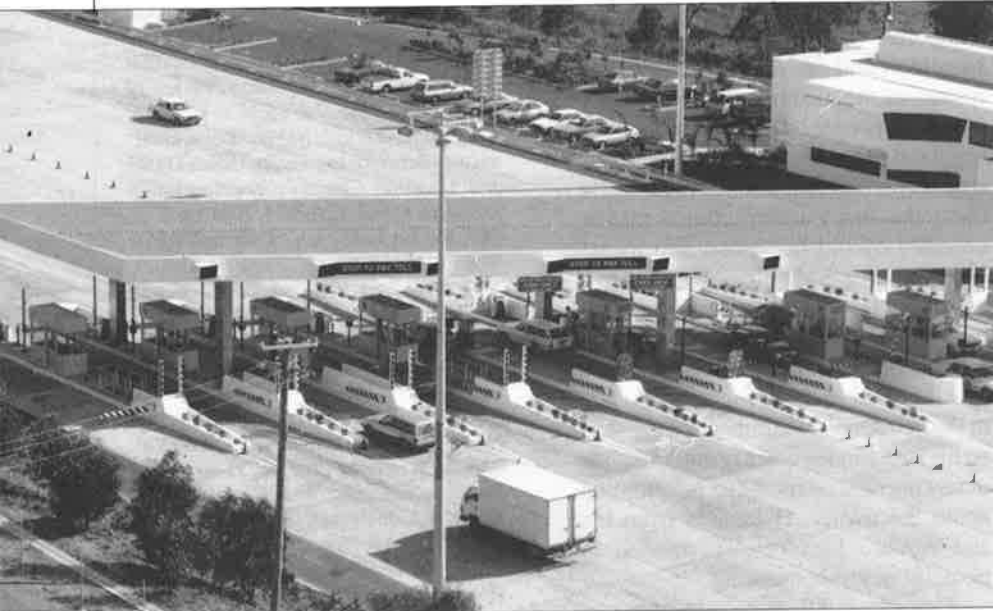
Paying a toll for access to a section of highway is a routine for most motorists, but is it the most equitable way of apportioning the costs of road use?

These developments have come in a gradual way, and there has been comparatively little public opposition. A prime example is banking at electronic tellers. The registration of a person's account number means that there is a record of a person's location (or at least the location of their card) at a particular time and place. Access to this information could be used for unscrupulous purposes, and its existence certainly reduces the 'invisibility' of a person's transactions.