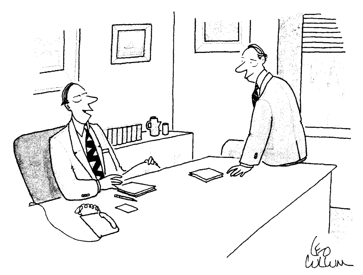
"Encouraging dissent is a good way of finding out who the traitors are."