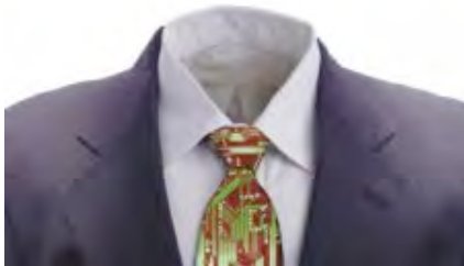
The invisible whistleblower ( http://jacynndaoun.wordpress.com/ )

So it can be quite difficult to find positive examples, but there are many “between the lines” [of the news media]: you will often see “documents seen by The Guardian ,” or “documents seen by the New York Times ,” or “an official speaking under condition of anonymity.”