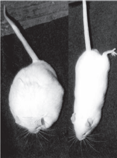
Fig. 3. A 9-month-old Swiss albino mouse (left) that was treated, as a newborn, with [monosodium glutamate] is shown beside the heaviest untreated male (right) from the same litter. 142 Reproduced with permission of the author.

Long before we thought of looking to medical literature for information about MSG, Olney and others had proved beyond the shadow of a doubt that monosodium glutamate fed to young laboratory animals killed brain cells in the arcuate nucleus of the hypothalamus, a brain region that helps control endocrine function. In addition, Olney and others had demonstrated that monosodium glutamate fed to young laboratory animals subsequently caused behavior and endocrine disorders such as stunted growth, ADHD, obesity, and reproductive disorders. 133,134,135,136,137,138,139,140,141