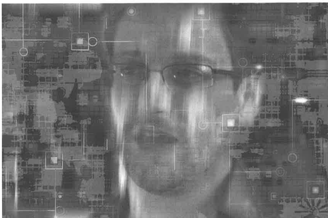
Edward Snowden: through a lens darkly.