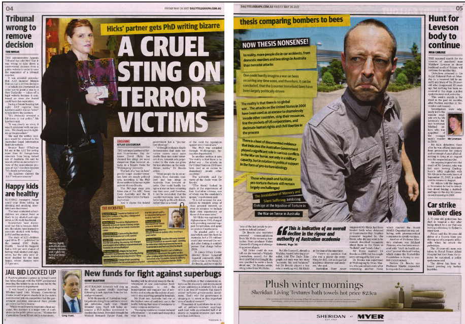
Figure 2: The inside spread on pages 4 and 5 in the Daily Telegraph, 26 May 2017.

an exaggerated importance, highlighting facts taken out of context, presenting highly misleading portrayals and using weak or dubious sources. For example, a story might portray a few incidents as revealing a dangerous trend. There might be lurid reports about break-ins in a particular suburb, indicating a crime wave, even though there has been no increase in break-ins and this particular suburb has no more crime than average.