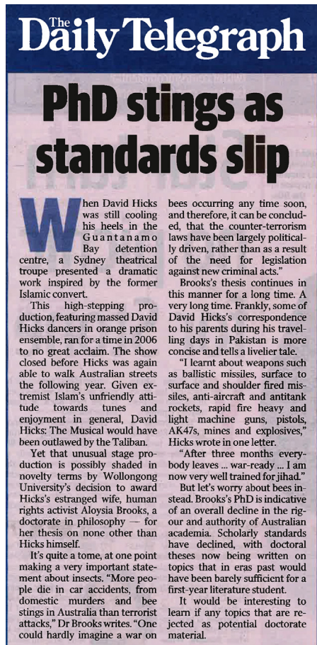
Figure 3: The Daily Telegraph editorial 'PhD stings as standards slip', page 30, 26 May 2017.

During the 21st century, terrorism has been an insignificant cause of mortality in the United Kingdom. The annualised average of five deaths caused by terrorism in England and Wales over this period compares with total accidental deaths in 2010 of 17,201, including 123 cyclists killed in