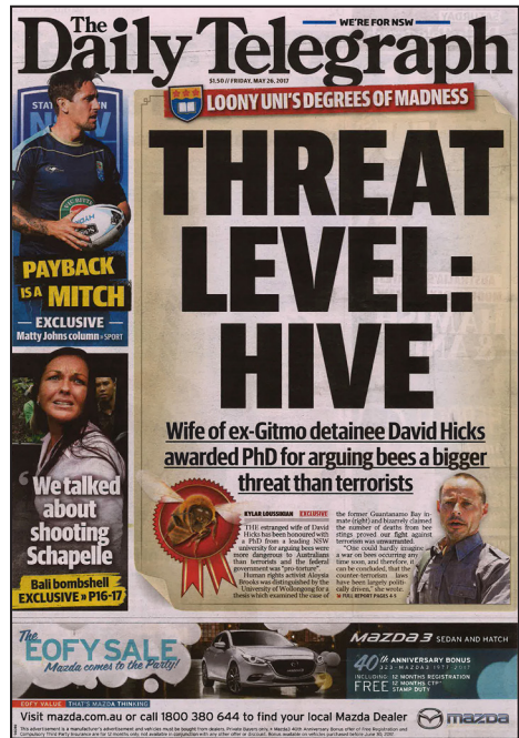
Figure 1: The Daily Telegraph front page, triggered by a doctoral thesis, 26 May 2017.

In the context of the media, a beat-up is a story that, by conventional journalistic standards, does not deserve to be published because it is unverified, grossly exaggerated and/or knowingly false. Typical features of beat-ups include presenting manufactured claims, giving otherwise unexceptional information