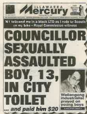
HOW THE NEWS BROKE: The Illawarra Mercury of May 16, 1996.

"The handsome bachelor of independent means was at it again yesterday. 'It is a wonderful, wonderful city, so why shouldn't I say so?' he asked."